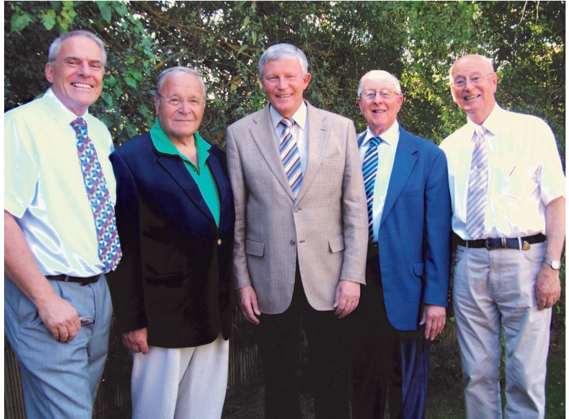
Four of our trustees with a 'friend of Jah-Jireh' pictured near the south east project location recently

about this or any of our other projects or you would like to become a 'friend of Jah-Jireh' please contact us at our Head Office on 01772 633380 or visit our website www.jah-jireh.org for further information.