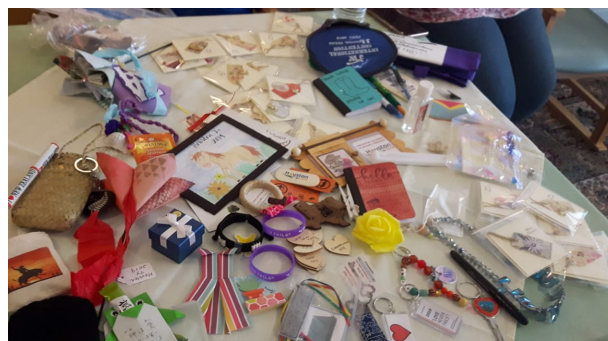
Gifts for residents from Houston, Texas