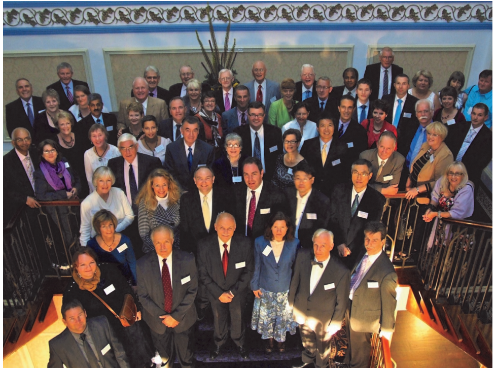
Delegates representing 9 countries

All gave reports on issues they were battling to overcome. For example, local authorities, purchasing of land, and the financial and legal complications of setting up a charity.